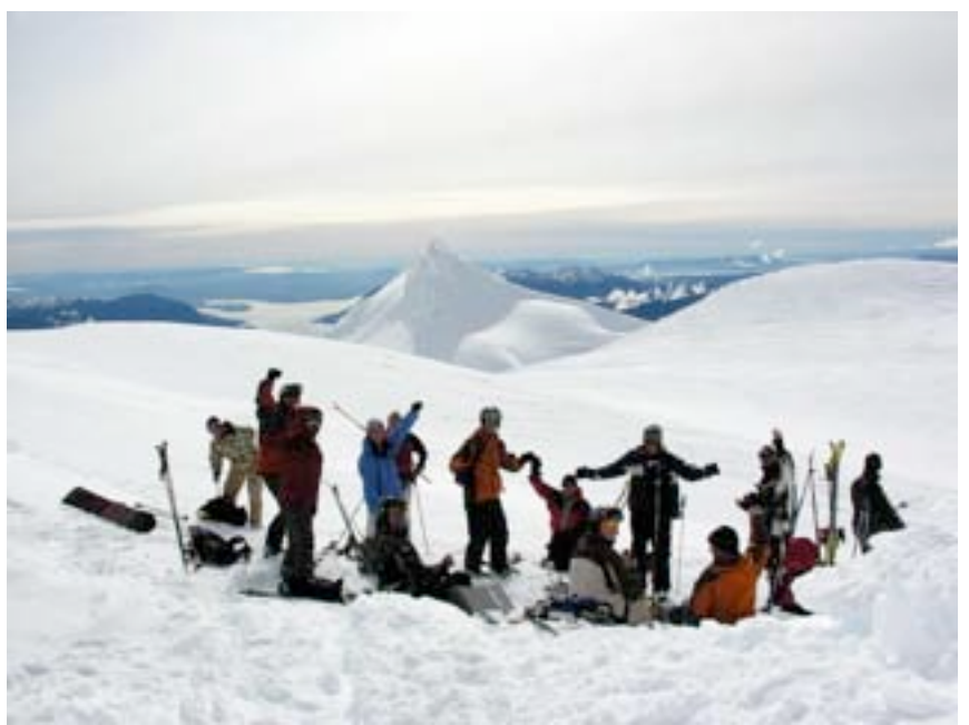
On the top of Voclano Mocho with Choshuenco in the background.

Drop down south and onto our last two volcanoes. Casablanca is a ski resort with 4 ski lifts so this is big and crowded, I must have counted at least 20 other skiers! This was a totally different experience and again the drive up, the scenery and the skiing spectacular. The hike to the top of the volcano takes between 3 to 4 hours and even for non hardened ski tourers is easy. The skiing down is awesome and again just pick your route and enjoy. If you have time you can use the local lifts to ski off piste to your hearts content.