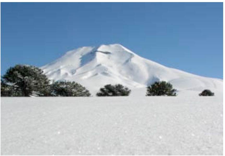
The majestic Volcano Lonquimay – The place to ourselves!

Don't forget we're in the southern hemisphere so it's the other way around. There are numerous ways down but the best is straight down the south face through the gap in the rock face you can see in the photo.