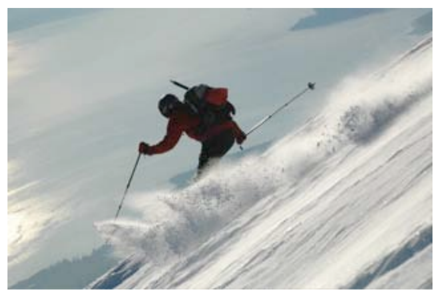
Skiing down Osorno Volcano with Lake Llanquehue in the background