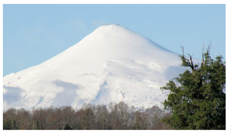
Villarrica, one the most famous of all the Chilean Volcanoes

Onto the national park of Huilo Huilo and volcanoes Mocho and Choshuenco. Up to this point you could easily be forgiven if you have thought it cannot get any better. But Huilo Huilo is the most amazing place I have ever been to. Again we have the mountain to ourselves, private trucks to take us through the national park to the base of the volcano and our own snow cat to get us as high as possible. Huilo Huilo has no ski lifts! Yep you heard right, no lifts. But who needs lifts when you have your own private snow cat. From where the snow cat drops us it's only a short one hour hike to the top of each volcano and from there the whole area to yourself.