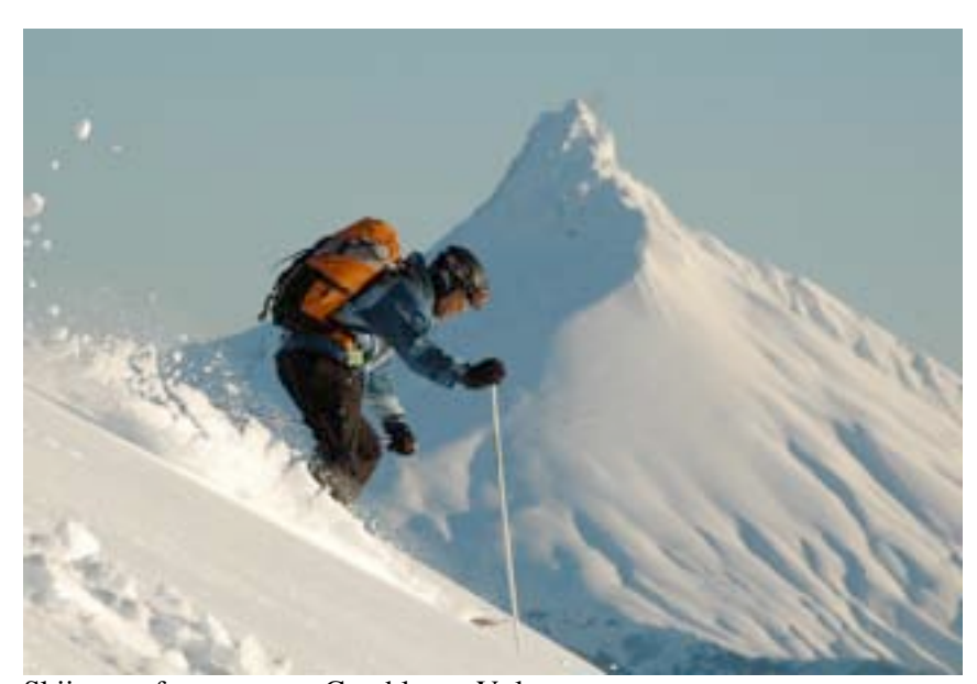
Skiing perfect snow on Casablanca Volcano

Drop down south and onto our last two volcanoes. Casablanca is a ski resort with 4 ski lifts so this is big and crowded, I must have counted at least 20 other skiers! This was a totally different experience and again the drive up, the scenery and the skiing spectacular. The hike to the top of the volcano takes between 3 to 4 hours and even for non hardened ski tourers is easy. The skiing down is awesome and again just pick your route and enjoy. If you have time you can use the local lifts to ski off piste to your hearts content.